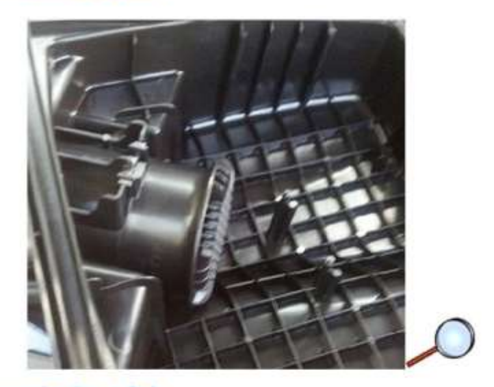
Chevrolet Cruze Only